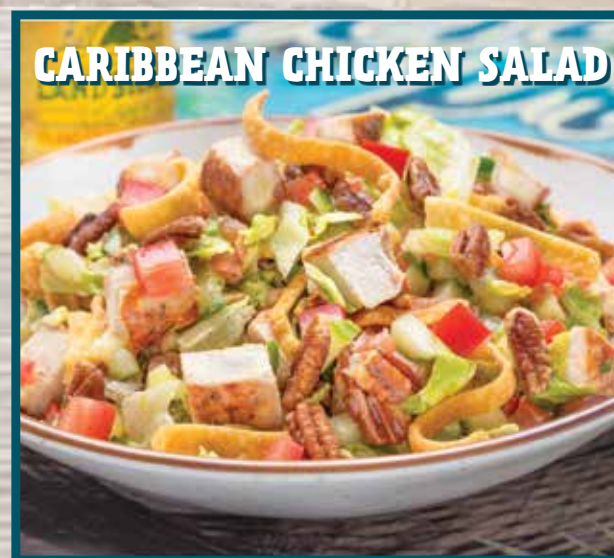
CARIBBEAN CHICKEN SALAD

Chopped greens tossed with English cucumbers, diced Roma tomatoes, candied pecans, wonton strips and house-made mango ranch dressing. Topped with grilled and diced chicken breast $14.99