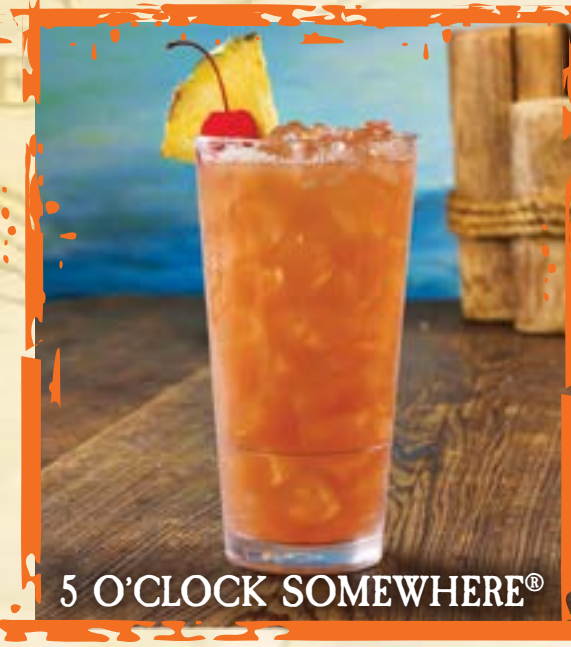
5 O'CLOCK SOMEWHERE®

*2,000 calories a day is used for general nutrition advice, but calorie needs vary. Additional nutrition information available upon request.